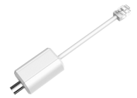
LR1002 ePoE Over Coax Converter