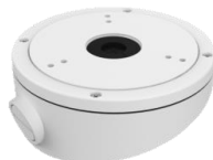
DS-1281ZJ-M Inclined Base Mounting Bracket